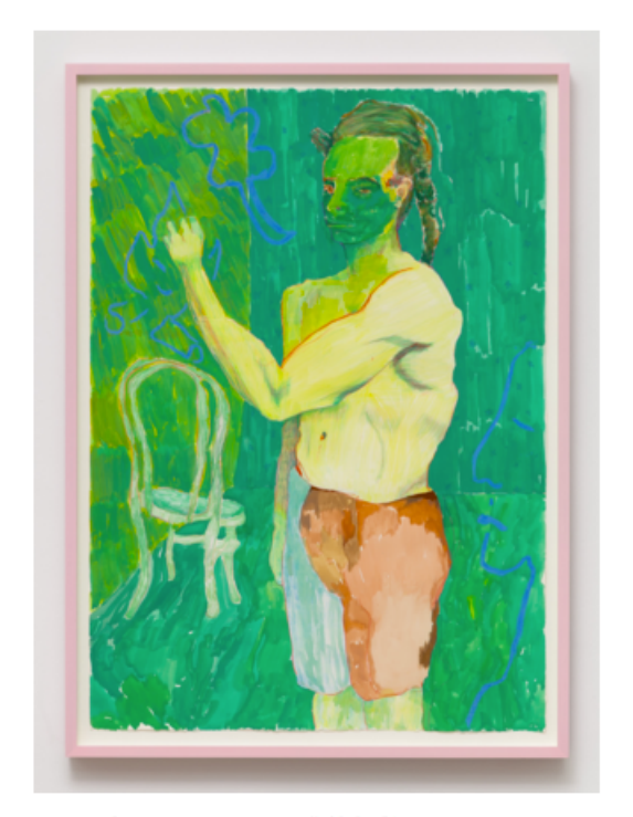
Alex Chaves, "Painter" (2016) Ink, paint, colored pencil, and marker on paper (click to enlarge)

The show's title, a tongue-in-cheek reference to Pablo Picasso's early obsession with reds, oranges, pinks, and earth tones, alludes to the Modernist, post-Impressionist, and Expressionist influences Chaves blends in these canvases. In addition to overt Picasso homages — a harlequin appears in one dreamy landscape — echoes of Egon Schiele show up in moody, bony-shouldered figures, some set amid jungly, Paul Gauguinesque backdrops.