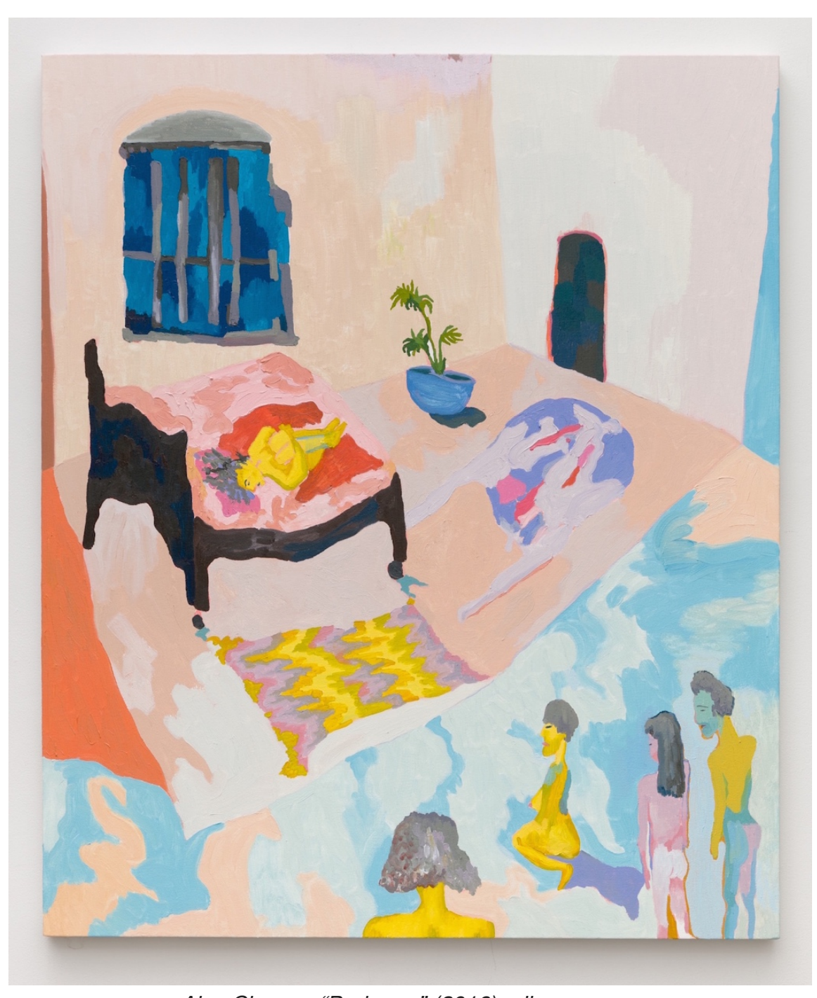
Alex Chaves, "Bedroom" (2016), oil on canvas