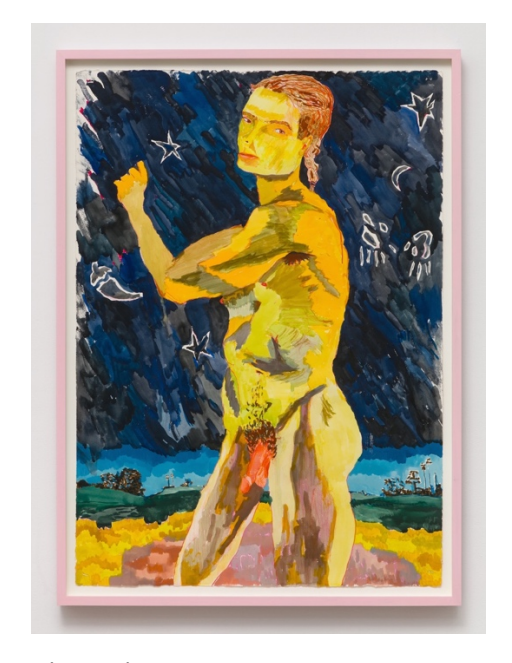
Alex Chaves, "Painter" (2016), ink, paint, colored pencil, and marker on paper

With all the blossoms and babies, it's a seasonally appropriate show, but there's just enough hallucinatory weirdness to offset any sentimentality. In the dreamy, Matisse-like interior "Bedroom," the floor opens up into a cloudy sky filled with wan green figures; the wiggling walls and bed frame seem to be melting. The characters in these paintings are not skipping, but floating through stoned hazes, into spring.